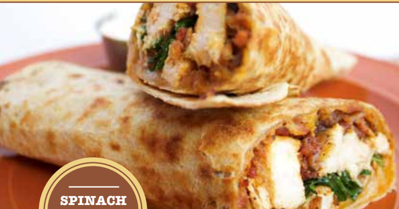
SPINACH WHEAT WRAP

Homemade roasted red bell pepper hummus finished with fresh basil. Served with celery stalks and grilled pita wedges. 9.49