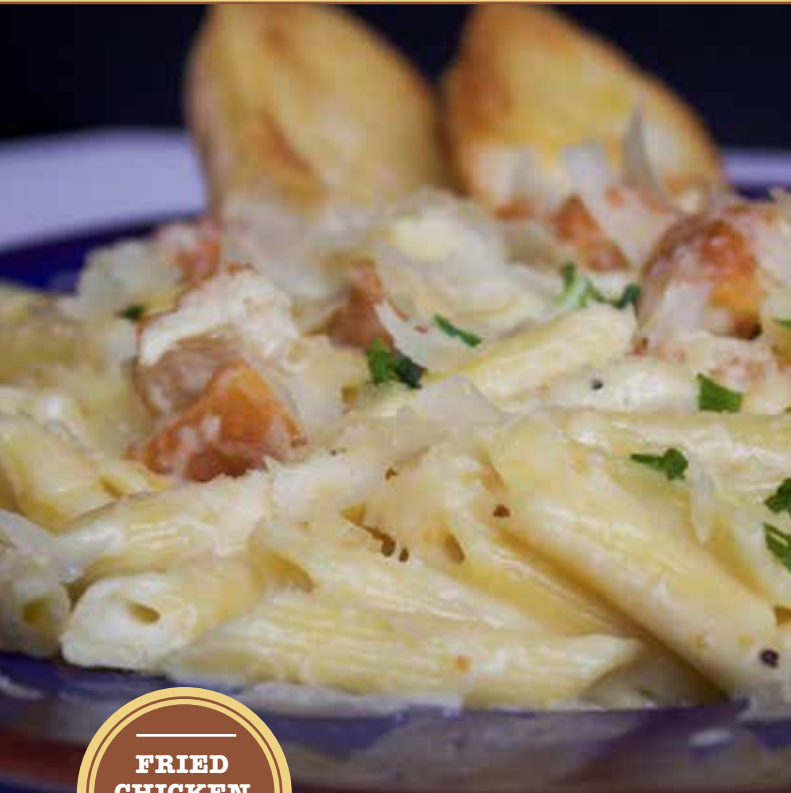
FRIED CHICKEN PASTA

Blackened whitefish fillet served with a baked potato and grilled vegetables. 11.99